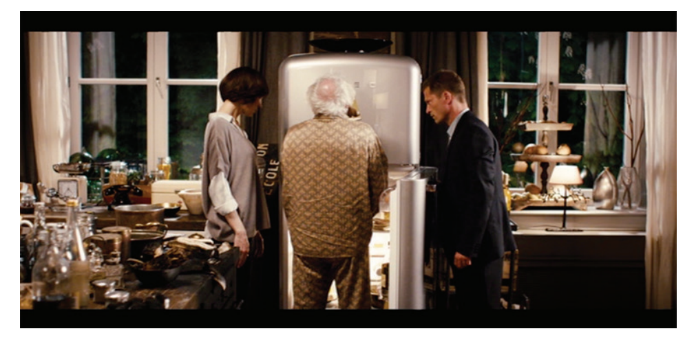
Figure 5: Amandus urinating

Schweiger/Matt Dillon) and Sarah (Jeanette Hain/Emily Mortimer), for example when he almost burns down the house, inadvertently sets off fireworks or urinates in the fridge in their presence.