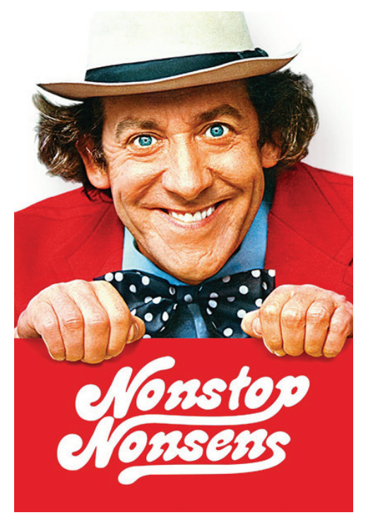
Figure 1: Cover image of Nonstop Nonsens (1975/2012)