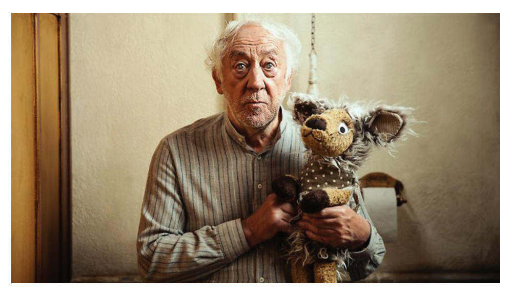
Figure 2: Dieter Hallervorden as Amandus