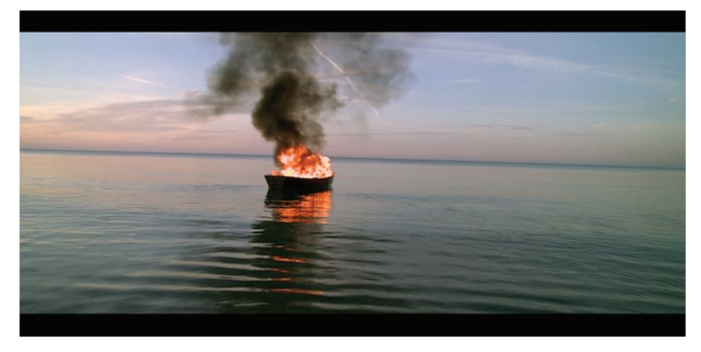
Figure 10: Walter's boat on fire

Anglica Wratislaviensia 58, 2020 © for this edition by CNS