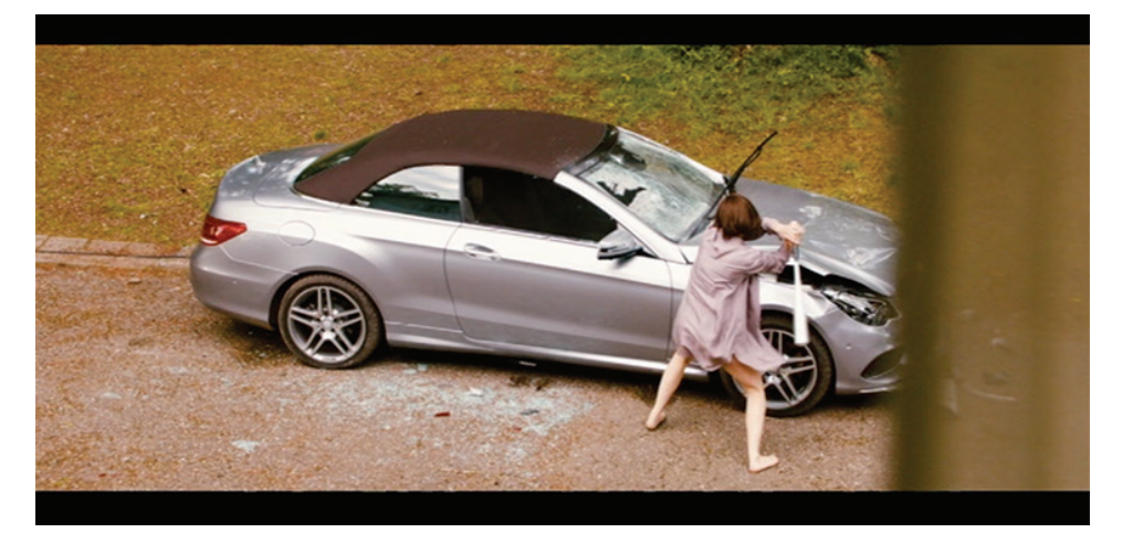
Figure 14: Sarah destroying her car

Repeatedly, the film evokes the stereotype of the hysterical woman, for example when, in sheer frustration, she demolishes her own car with a baseball bat.