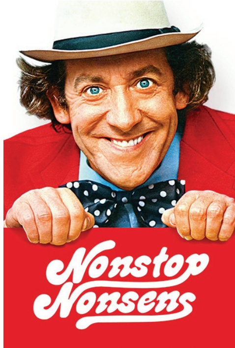
Figure 1: Cover image of Nonstop Nonsens (1975/2012)