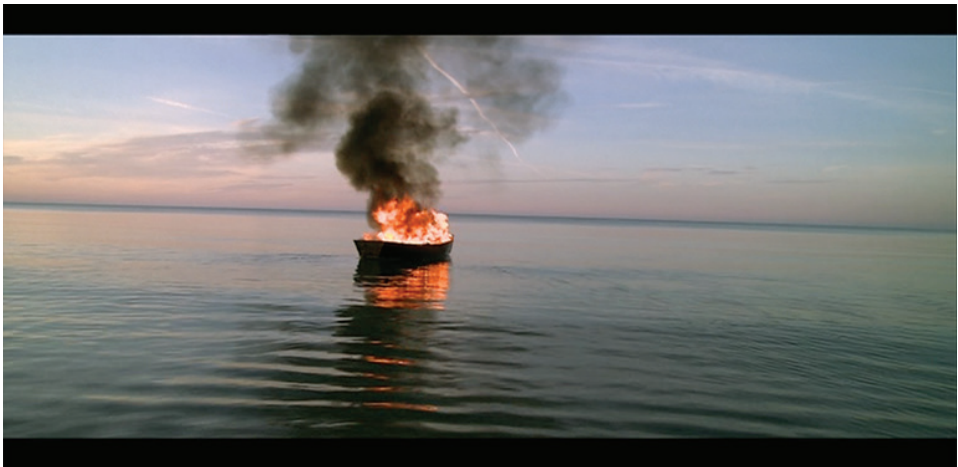
Figure 10: Walter’s boat on fire