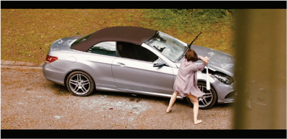
Figure 14: Sarah destroying her car

Repeatedly, the film evokes the stereotype of the hysterical woman, for example when, in sheer frustration, she demolishes her own car with a baseball bat.