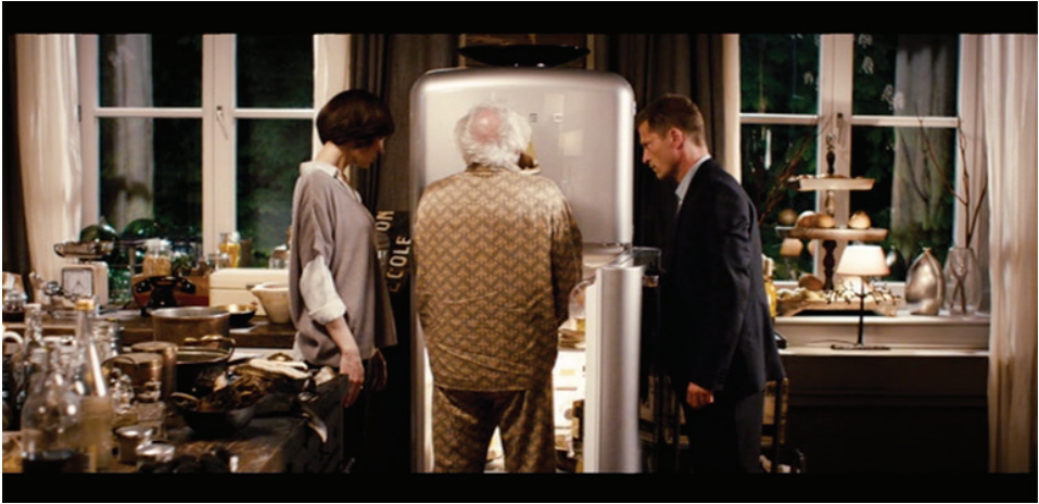
Figure 5: Amandus urinating

Schweiger/Matt Dillon) and Sarah (Jeanette Hain/Emily Mortimer), for example when he almost burns down the house, inadvertently sets off fireworks or urinates in the fridge in their presence.