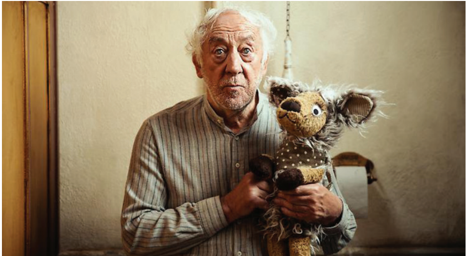
Figure 2: Dieter Hallervorden as Amandus