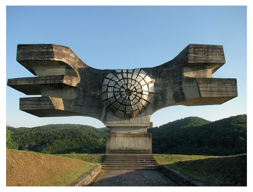
Figure 2: The monument in Podgarić