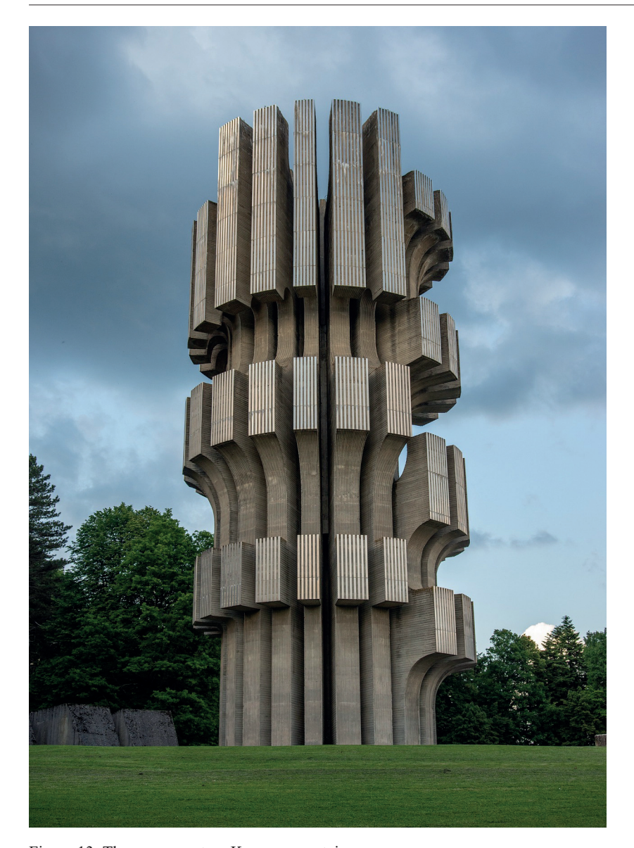
Figure 13: The monument on Kozara mountain