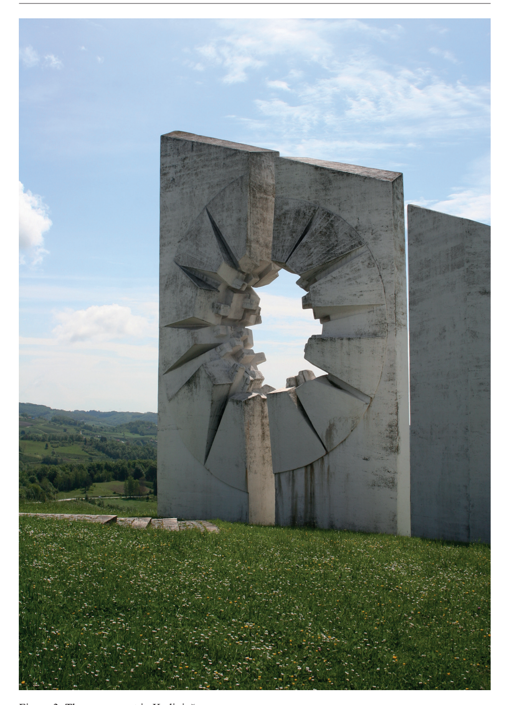
Figure 3: The monument in Kadinjača