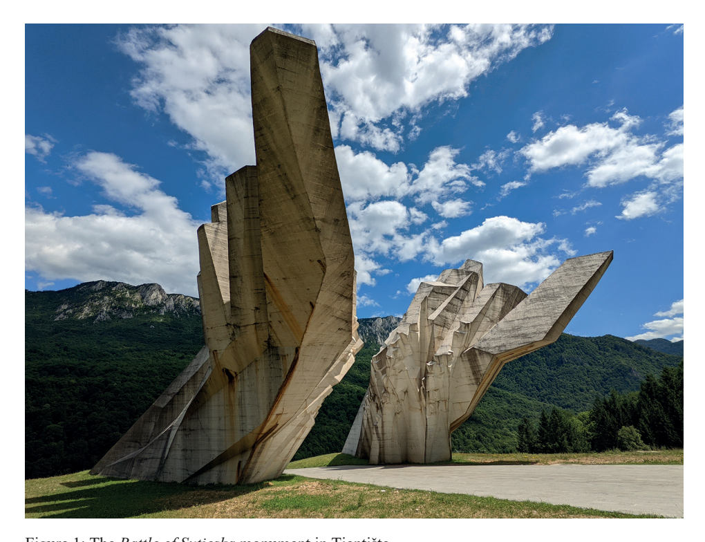
Figure 1: The Battle of Sutjeska monument in Tjentište

nations of the former Yugoslavia were trying to create a therapeutic agent in the form of memorials, and the size of the effect had to be equal (or higher) to the size of the suffering endured during the war. Hence the quality of monumental forms and vertical expressions in some of the memorials as intensifying elements of the passive position of the observer, although none of the monuments have a tendency to fully subordinate the subject, which was typical of fascist and Stalinist monumentalism (Kirn and Burghardt 14). The size, therefore, had only one purpose—to show the strength of remembrance to the ones who were equal to people, but performed massive achievements. Some of the most prominent bearers of this metaphor are the monuments in Tjentište (see Fig. 1), Podgarić (see Fig. 2), and Kozara.