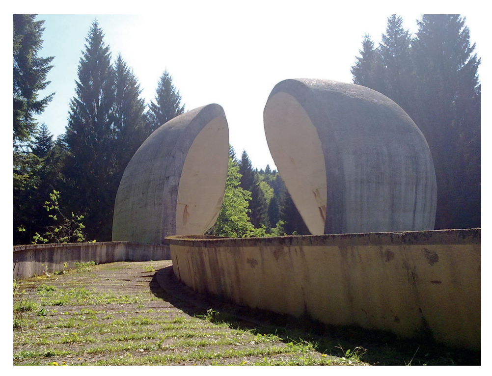
Figure 10: The monument on Grmeč mountain