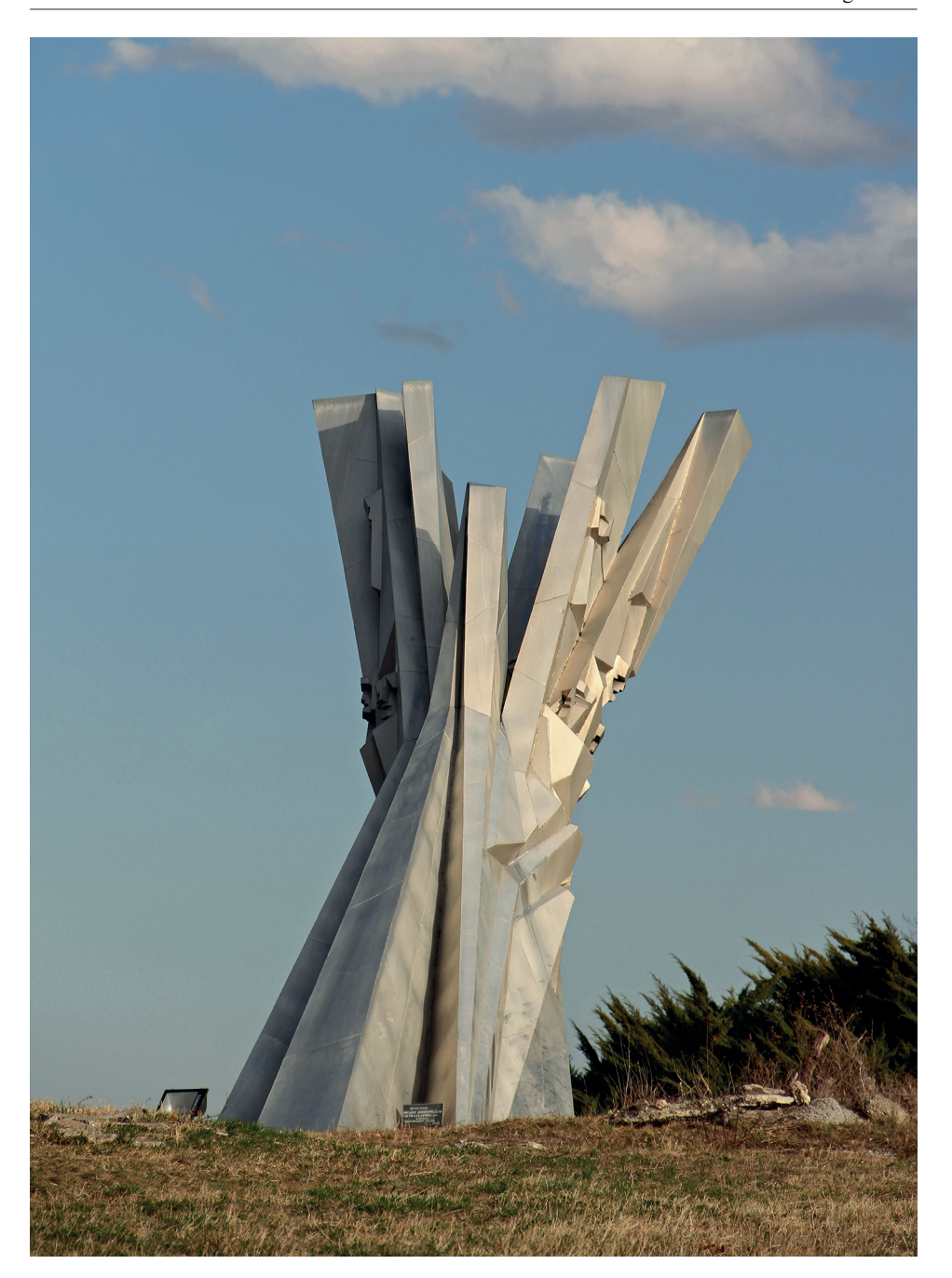
Figure 8: The monument in Ostra