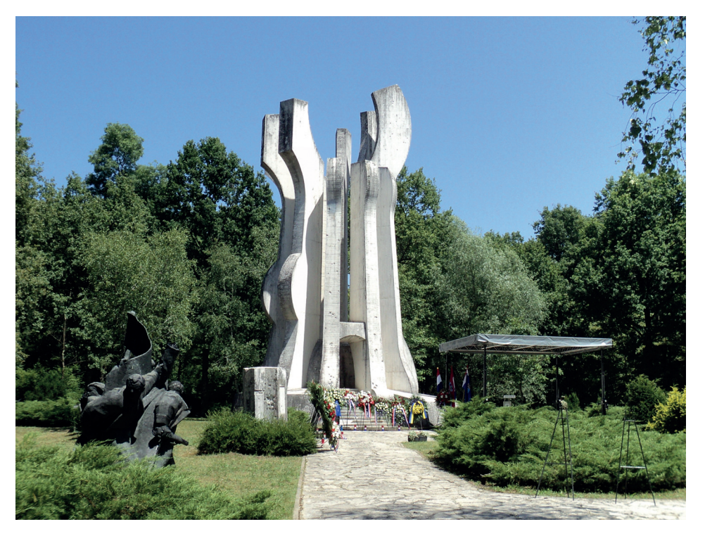
Figure 6: The tree monument in Sisak