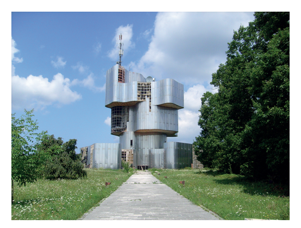
Figure 11: The monument in Petrova Gora

The analyzed monuments were made from a typical brutalist set of materials. Concrete, metal constructions, steel/aluminum plates, and glass dominate the forms and present a stark contrast to their surroundings. The choice of construction material for the monuments also possesses certain metaphorical property. The quality conveys a hard, unrelenting surface, rock/metallic texture, and a general opposition to the material found in nature. The brutalist focus on material that represents strength suggests the visual manifestation of the metaphor METAL/CONCRETE IS STRENGTH. Not only were size and volume employed as meaning bearers, but the physicality of the monuments also had to convey the message of strength that overcomes the protruding, seemingly stronger and unstoppable enemy forces. Additionally, colour and reflective quality of certain materials were used as well, for example—panels reflecting the sky, granite and concrete as light-coloured material, etc.