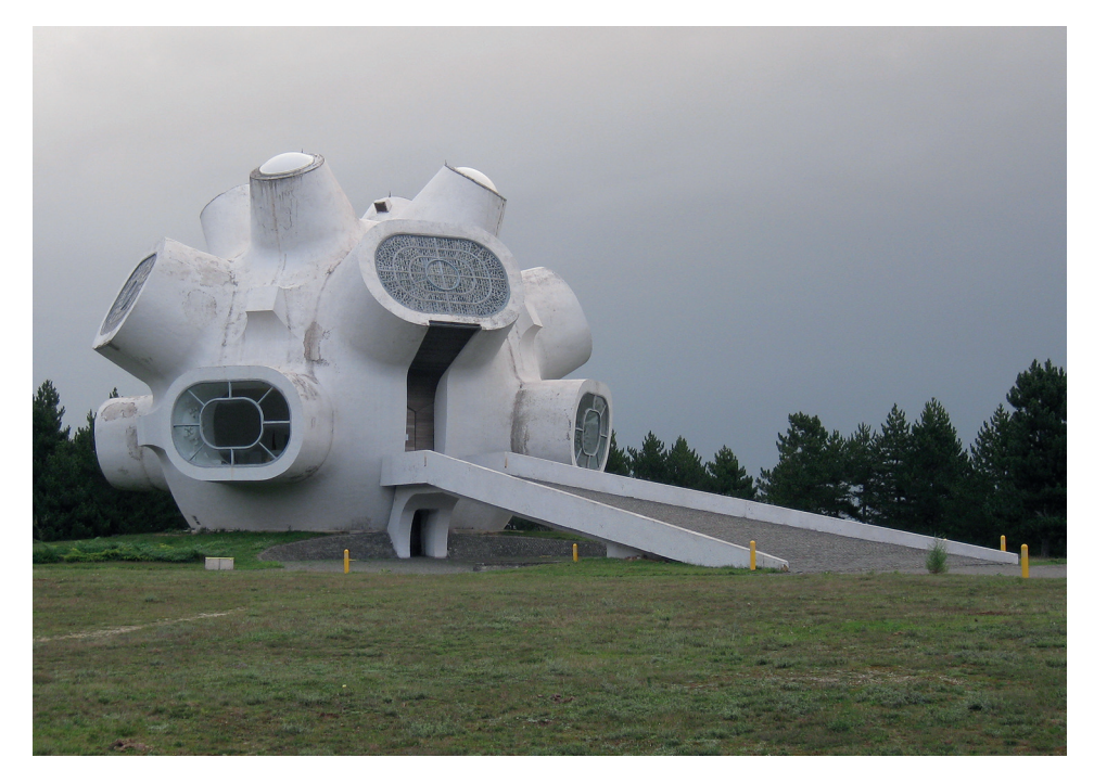
Figure 12: The monument in Kruševo