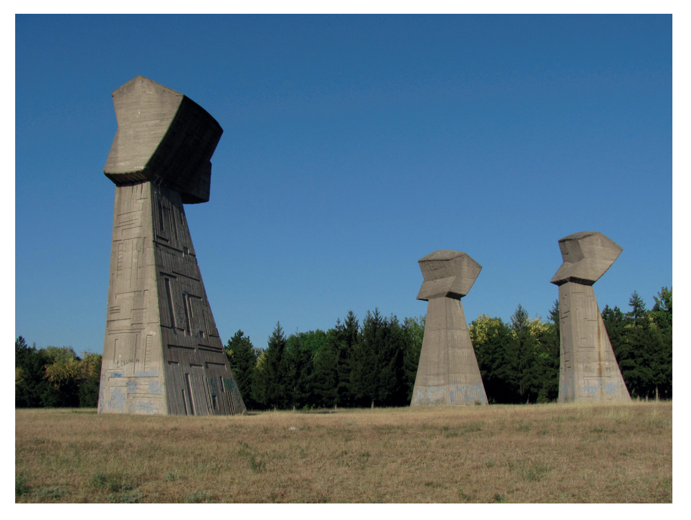
Figure 7: The monument in Niš

Niš memorial (see Fig. 7) depicts fists raised high as a sign of resistance against the enemy. We can discern two major metaphors in Niš: EPISODIC EVENTS ARE OBJECTS, as the fists symbolize the resistance and final victory (Car), and ACTION IS MOTION, as fists are protruding from the soil and being raised to the sky. The