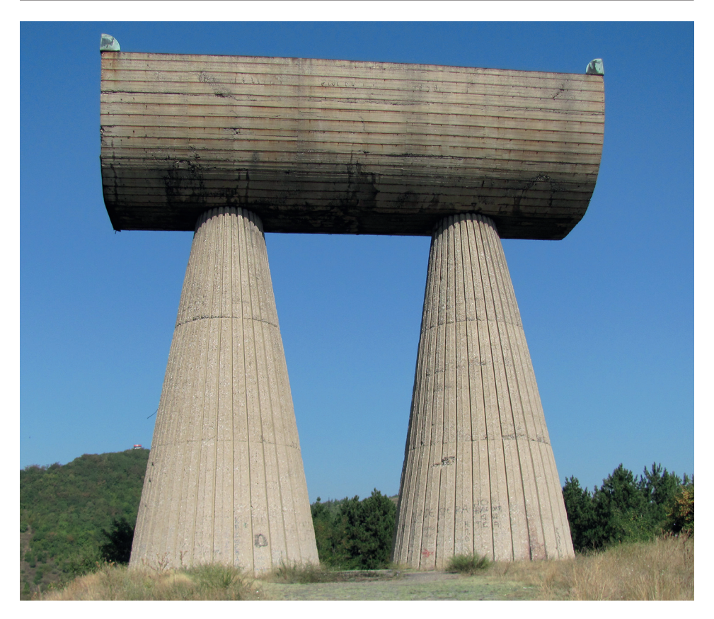
Figure 4: The monument in Kosovska Mitrovica