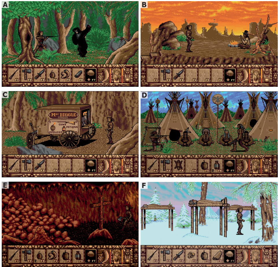
Figure 5: A selection of situations from Colorado

the standard trope of the all-conquering white protagonist (cf. Jayanth). However, the caveat should be made that across Silmaril's oeuvre, the inexplicable hostility of other characters regardless of location and ethnicity is standard, with combat simply constituting a core gameplay component of their side-view action games. Indeed, compared to Manhattan Dealers (1987), Targhan , and Star Blade (1990), Colorado may be noted for the unusual presence of many friendly characters, who both aid O'Brian and must also be aided by him.