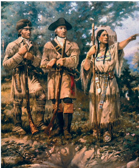
Figure 3: Lewis and Clark at Three Forks by Edgar Samuel Paxson

Source: “Front Cover for Colorado (DOS).” MobyGames . Retrieved from https://www.mobygames.com/game/1722/colorado/cover/group-24629/cover-62552/ . 5 May 2023.