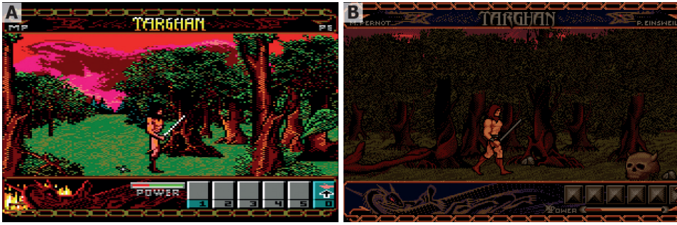
Figure 1: Different versions of Silmarils’s Targhan (1989): (A) Amstrad CPC; (B) Amiga