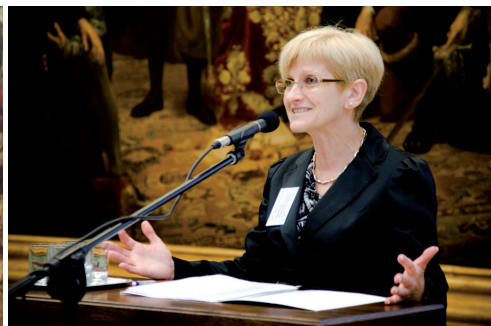
The speech of President of PCA — Bogusława Dobek-Ostrowska