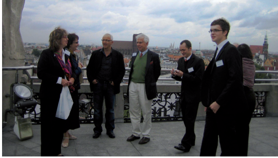
The guests on the University tower