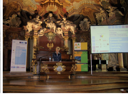
Opening ceremony