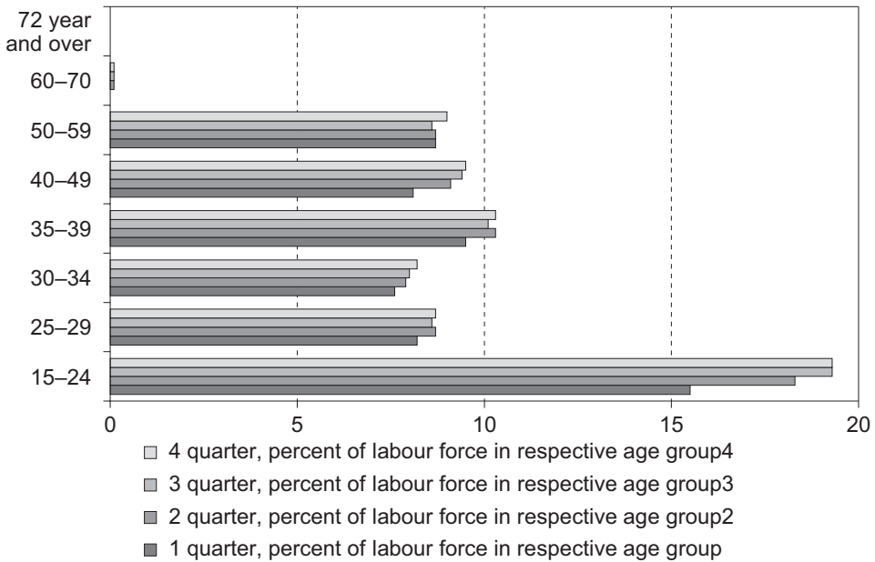
Figure 1. Dynamics of the number of unemployed in 2020 (by age groups)