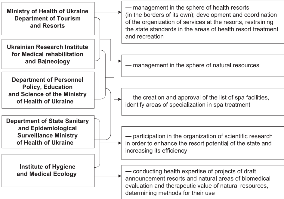
Figure 1. Functional structure of governing health-resort organizations

Thus, as it follows from Figure 1, health resorts activity refers both to tourism and to medicine related to tourism and recreational organizations with dominant therapeutic, preventive, and rehabilitation functions.