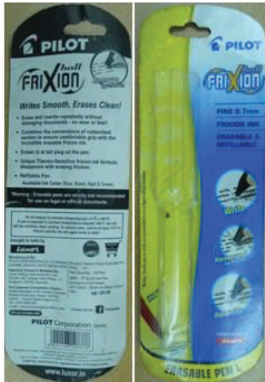
Figure 2. Front and reverse side of wrapper of PILOT FriXion erasable ink pen