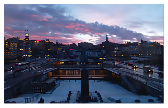
Figure 1. Slussen area during different seasons