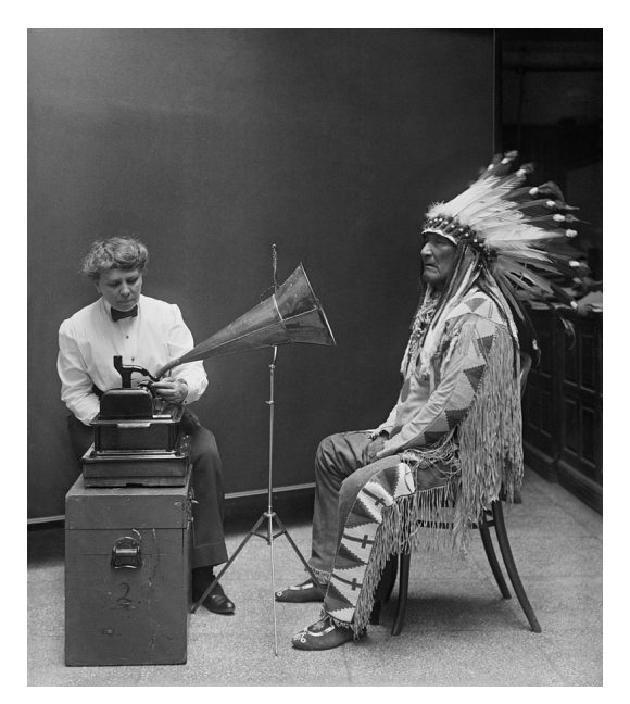
Figure 2. A photograph of ethnographer Frances Densmore collecting songs from Blackfoot chief Ninna-Stako in 1916