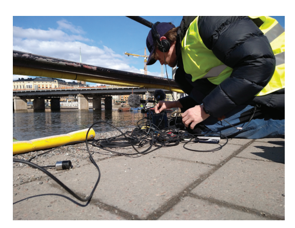
Figure 5. The author performing at Slussen as part of Riversssounds, an artistic project and residency for sound artists working with soundscapes of European rivers, April 2021