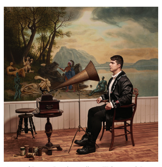
Figure 3. Cover of Jeremy Dutcher's album Wolastoqiyik Lintuwakonawa featuring a photograph of the artist by Matt Barns

Source: Library of Congress, https://www.loc.gov/pictures/item/2016844693/ (accessed 7.06.2022).