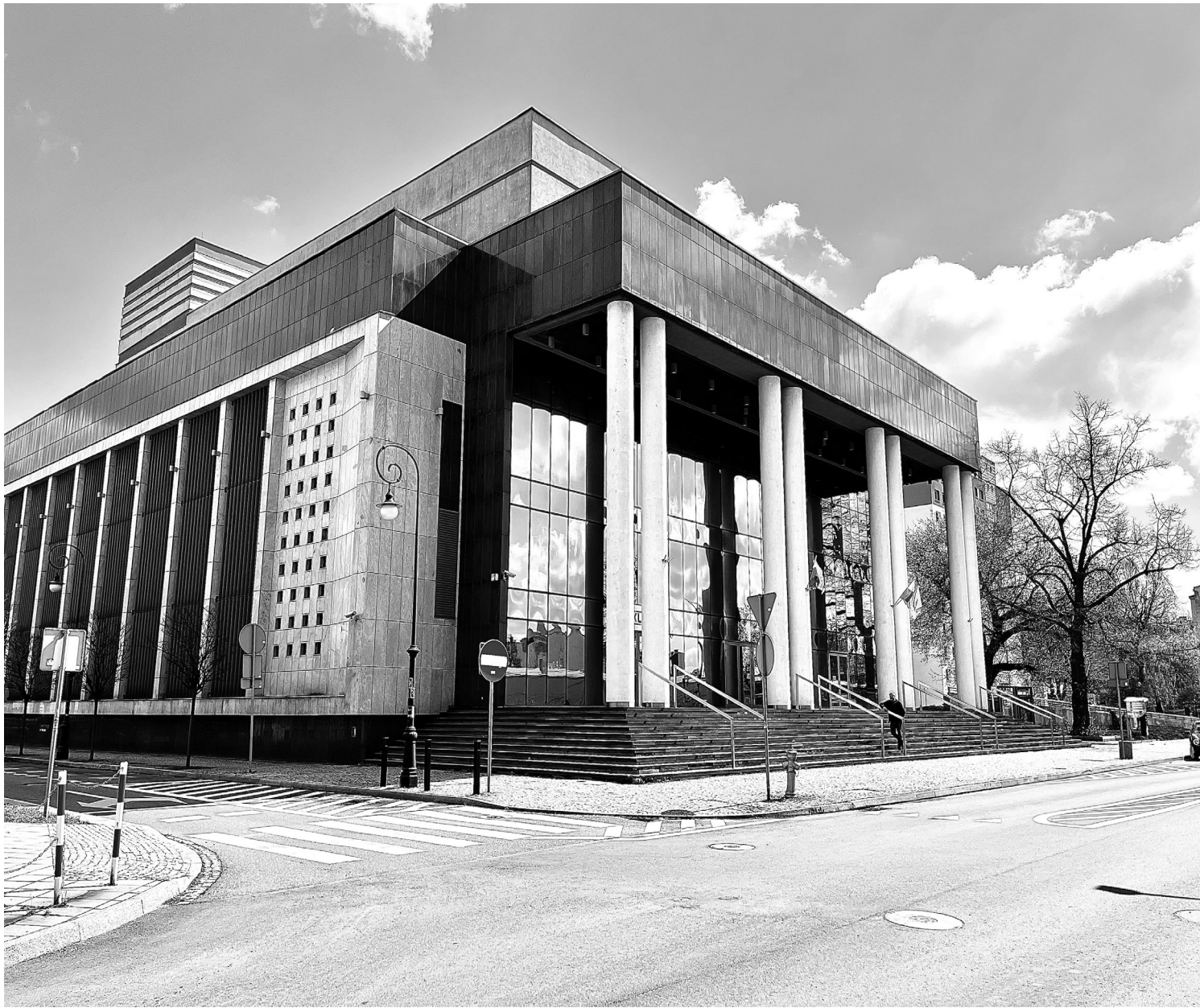
4. The Philharmonic in Częstochowa built on the site of the New Synagogue.