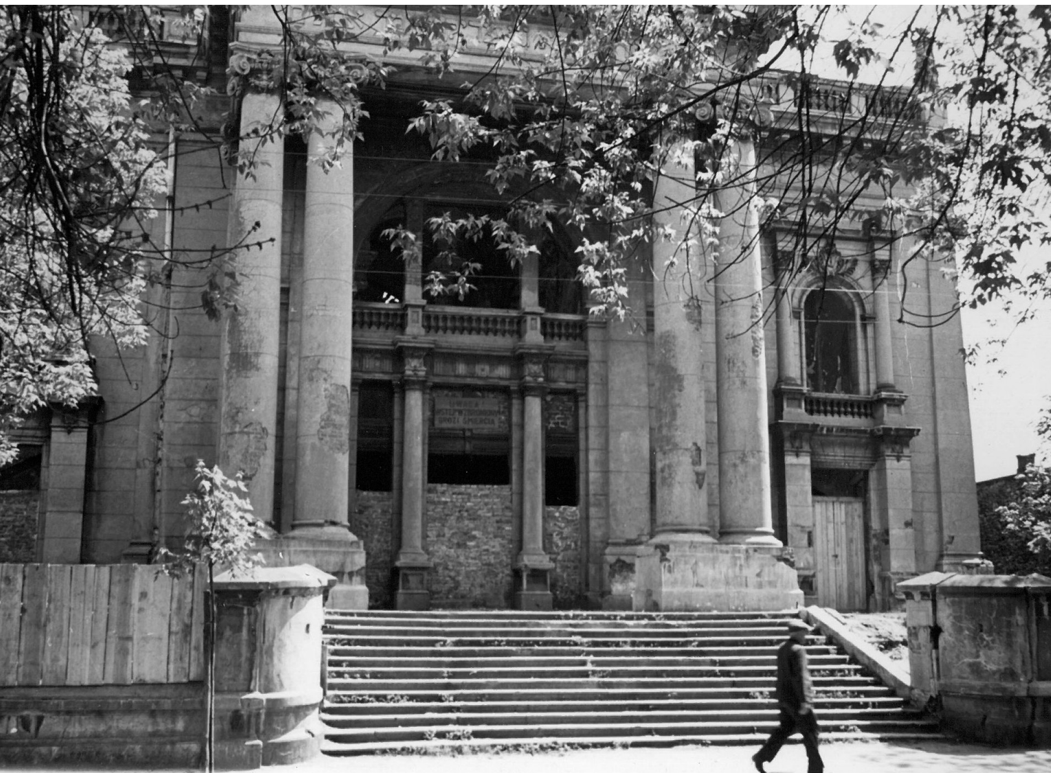
3. The I of the synagogue with a bricked-up entrance and an inscription in Polish, "Attention! No trespassing. Threats of death", after World War II, before December 1957. Photo: Archives of the Częstochowa Philharmonic (not published so far)