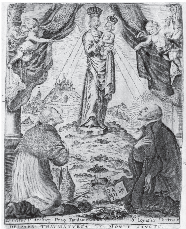
Fig. 9. Copperplate frontispiece with the Madonna in front of whom kneels Prague archbishop Arnošt from Pardubice and on the right St. Ignatius, on the sides there are soaring angels dragging a curtain, in the background stands the pilgrimage church on Svatá Hora in Příbram, in the bottom part there is the inscription DEIPARA THAVMATVRGA DE MONTE SANCTO , sign. B — XX. G. aa. 44

of votive gifts before a statue or picture of the Virgin Mary in the form of reduced imitations of human organs or bodies. The latter, together with medical aids such as crutches, were brought by pilgrims to the Virgin Mary so that she could free them from their illnesses. 91 The prints included heraldic motifs in the form of signs