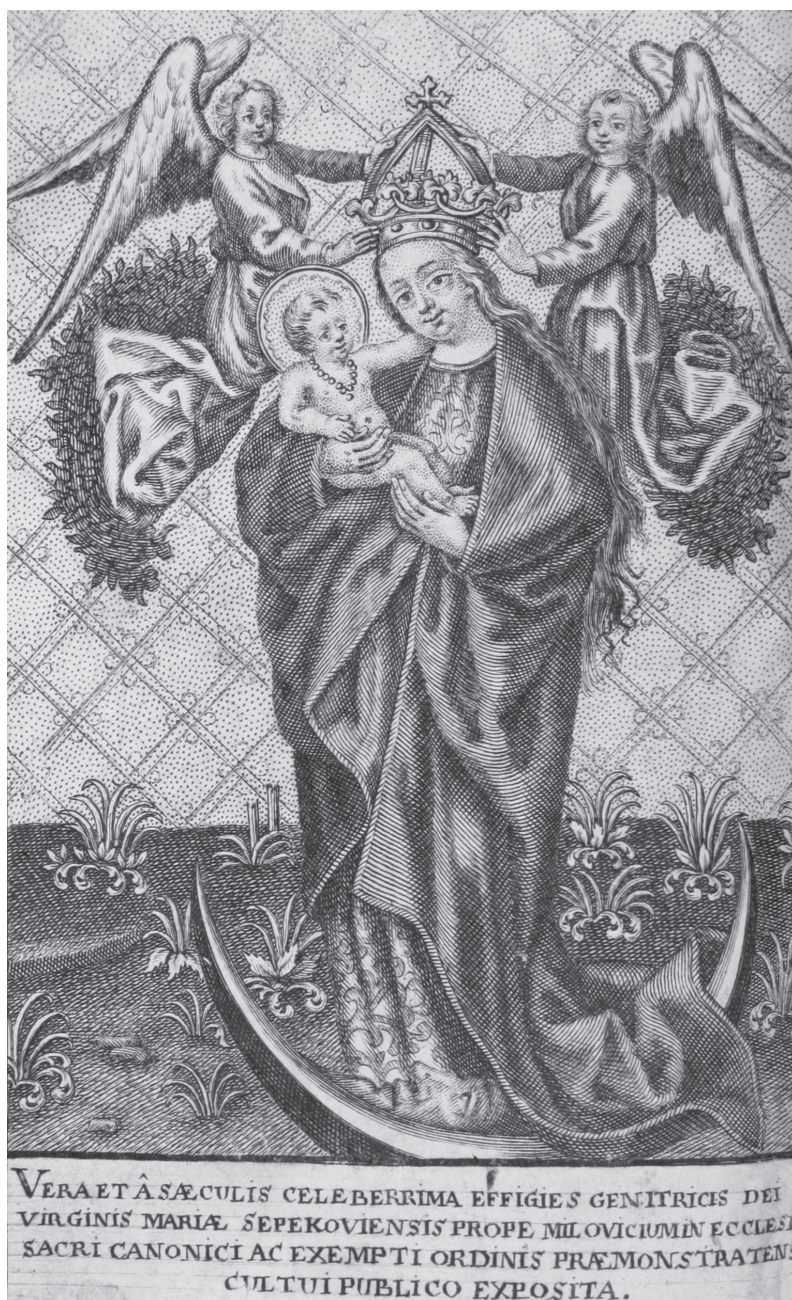
Fig. 1. Copperplate frontispiece with the depiction of Immaculata, crowned by angels, the bottom part is a Latin legend related to the pilgrimage site of Sepekov, sign. B — XX. F. bb. 17