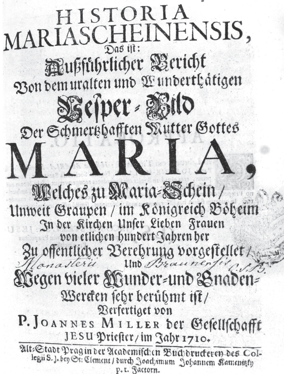
Fig. 3. Title sheet of the work Historia Mariascheinensis focused on the pilgrimage site Bohosudov. It includes the manuscript provenance of the Monasterii Braunensis O. S. B. with the stamp of the monastery, sign. B — XX. E. bb. 66