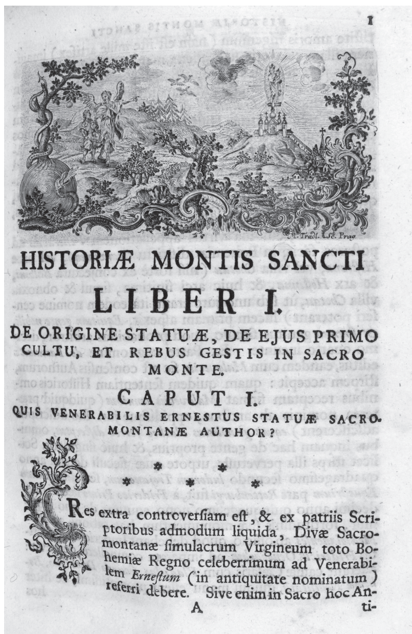
Fig. 7. Rococo cliché with a floral motif, typographical ornaments and a copperplate in the background depicting a pilgrim, who is accompanied by an angel to the pilgrimage church on Svatá Hora in Příbram, on the left there is a snake slithering around a tree, the scene is supplemented with rococos, signed by M. Traedl Sc. Prag, sign.