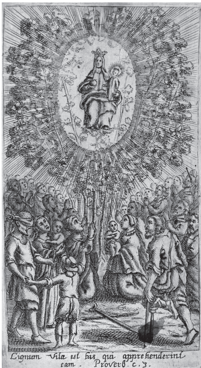
Fig. 8. Copperplate frontispiece with a depiction of the Madonna in the crown of a tree, which emits rays. Doves of people pray to the Virgin Mary, some of them are crippled or blind. In the bottom part there is the inscription Lignum Vitae est his qui apprehenderint eam. Proverb. c. 3. Proverb. c. 3, sign. B — XX. F. bb. 1