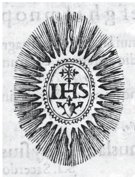
Fig. 5. Jesuit emblem with the monogram IHS, sign. B — XX. F. aa. 45, p. 304