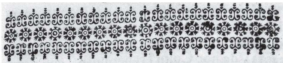
Fig. 6. Frieze formed by typographical ornaments, 14 × 74 mm, sign. B — XX. F. bb. 17, p. 7

Friezes were often formed from typographic decorations (fig. 6).