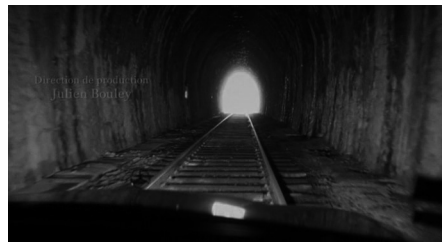
Fig. 2. Returning to the afterlife of the banlieue. Adieu Gary

Warshow writes that the landscape serves a dual function in the Western — it can either accentuate the stature of the hero or cut down his prominence (659). Amaouche films the banlieue street so that it smacks of desolation, sucking any vivacious energy out of its denizens. Walking down the street upon his arrival from prison, the hero