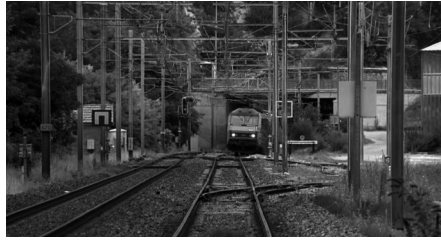
Fig. 9. Banlieue inhabitant takes on the SCNF train as a toreador. Adieu Gary