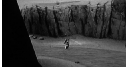
Fig. 8. Facing an Arab terrorist in a military video game. Adieu Gary