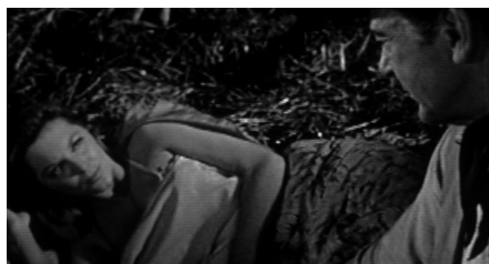
Fig. 5. Samir's post-coital moment juxtaposed against Gary Cooper's. Adieu Gary