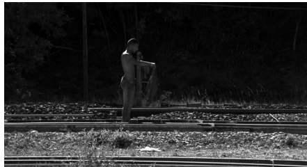
Fig. 9 cont. Adieu Gary