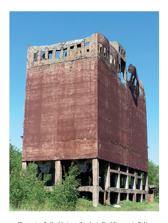
Illustration 2. Coal hoister. Synthetic Fuel Factory in Police

conduct and, whether willingly or unwillingly, they were obeyed. Kaczyński was aware of that. Lack of medicines, medical dressings or beds in the hospital for all who needed them persuaded him to perform a "natural selection", <sup>121</sup> that is help first of all those who had any chance to survive. When the war ended the area of Aussenlager Pölitz housed a pig farm (from 1950). In 1980 the area was passed on to the Municipal Cooperative Police to house construction materials warehouses, car repair shops, paint shops, a tyre service and metalwork. This so-called Craftsmen Estate existed until 2017.